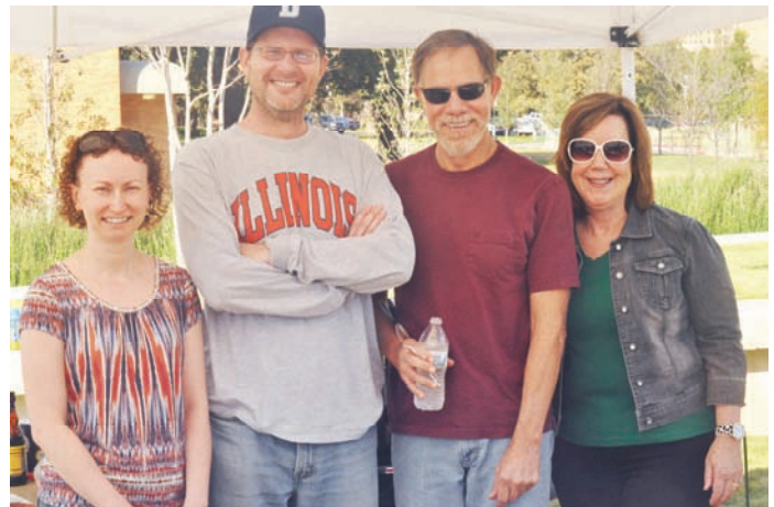
Faculty lend support to the annual event (pictured above, right).