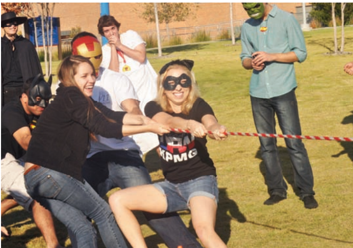
KMPG (pictured above, left) participate in the tug of war game. In addition to the cook-off, fun games, crafts and contests for children, adults and family are a great way to network with your peers.