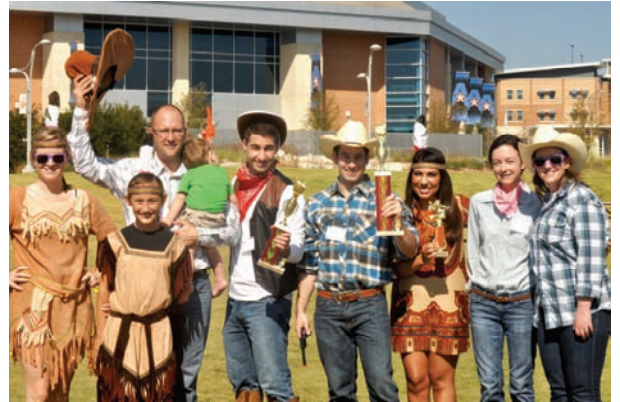
Grant Thornton makes another award winning appearance (pictured above).