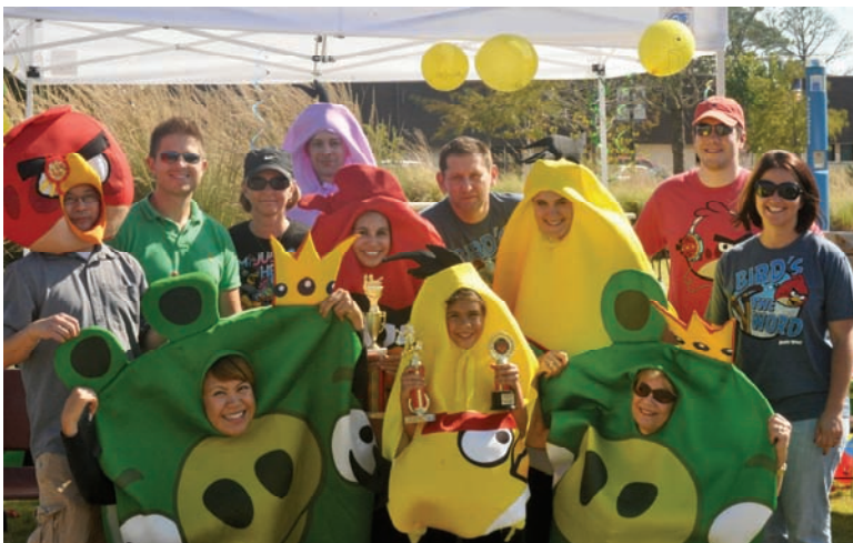
The Chili Cook-off last fall was a big success. We brought the firms back to campus to enjoy our beautiful new College Park green space. The weather was perfect and the chili was delicious. We hope you will join us next fall for another day of fun, games and great food for the entire family.