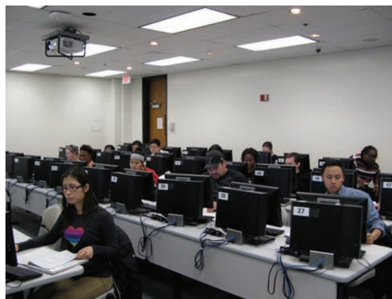
Student-volunteers undergoing VITA training to become IRS-certified in tax return preparation.